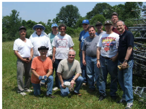
Teardown crew after unloading at Bob's