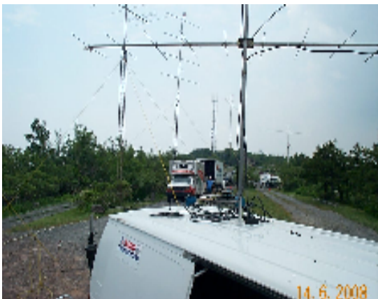
The whole W3CCX antenna farm