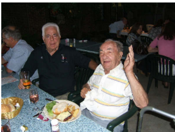
...post contest celebration, and ...