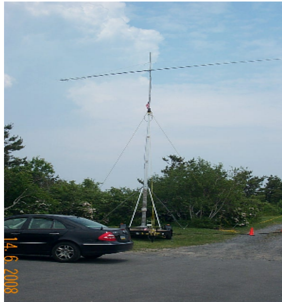
222 antenna on a beautifully engineered trailer tower