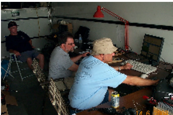
Microwave crew lining up another Q