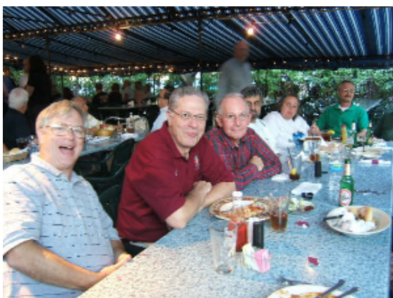
... a great evening for everyone!