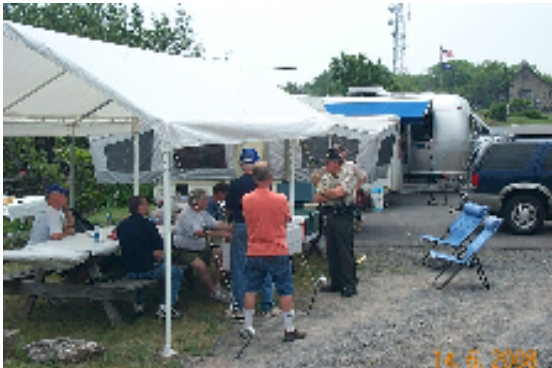
Talking to park ranger while lightning clears the area

There simply wasn't enough room last month to include all the pictures worth showing! Here are a few more.