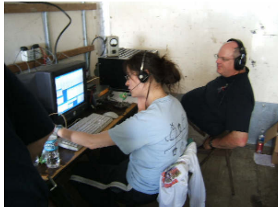
Logging another 432 QSO