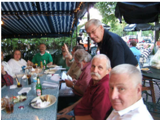
Dinner, election of officers, ...